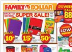
FAMILY DOLLAR VALID UNTIL AUG 05