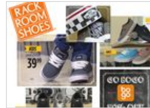
RACK ROOM SHOES EXPIRES THIS SATURDAY