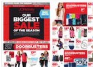
JCPENNEY PREVIEW THE DEALS