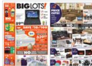
BIG LOTS 4 DAYS LEFT